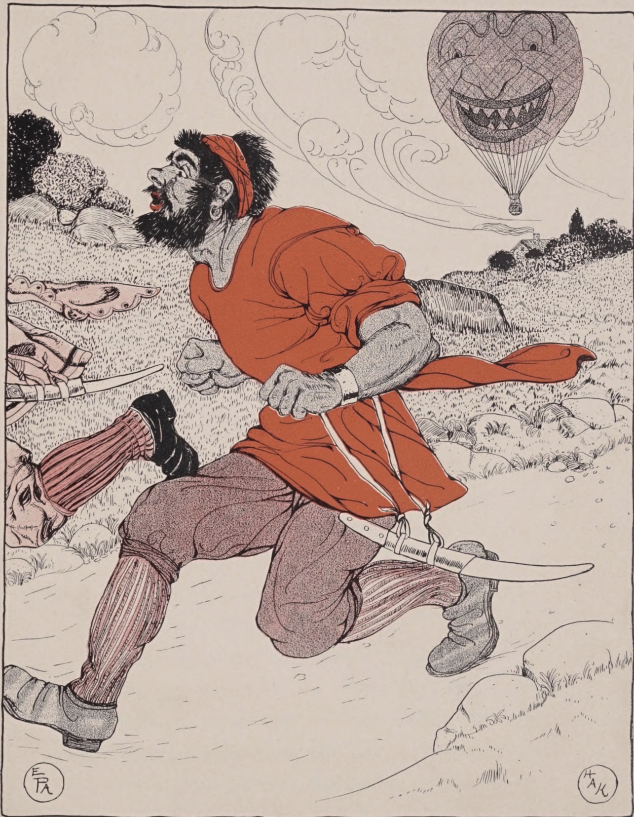
THEY RAN AT BREAKNECK SPEED DOWN THE ROAD